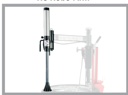
Allows technicians to efficiently change difficult wheel applications, such as low-profile wheels and run-flat tires.