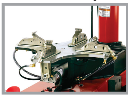
Quickly seals beads while tabletop inflation provides a faster workflow.