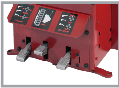
Provides precise control over every step of the changing process. The pedals are ideally placed for fluid technician movements while mounting and demounting tires.

tire changer, or any of our other quality products, contact your authorized Coats distributor or call 1-855-876-3864 for the