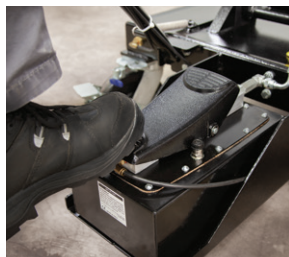
Push rear of foot pedal to raise table