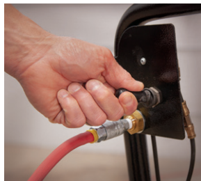
Air lock release is operated by a simple toggle switch