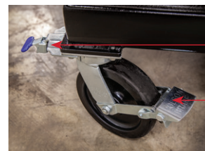
Directional locking tab