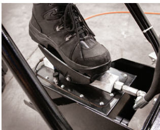
Push top of foot pedal to lower table