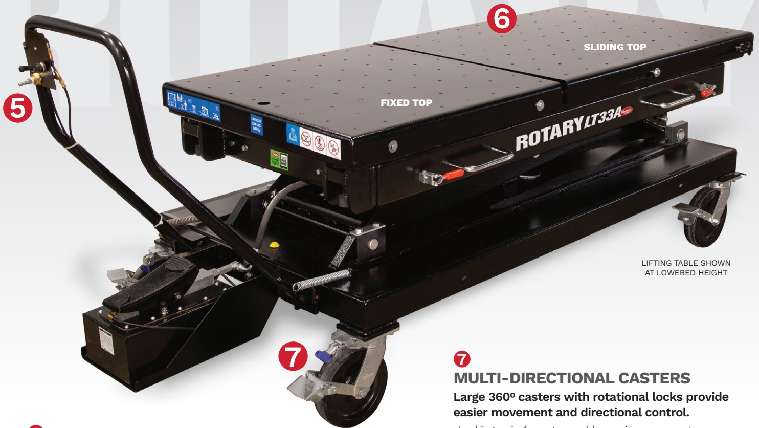
LIFTING TABLE SHOWN AT LOWERED HEIGHT