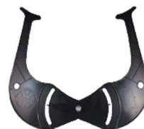
Rim Width Gauge 46FC77653