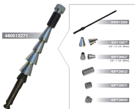
Motorcycle Shaft Kit 460013271