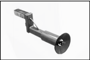
Offset Disc and Holder Tool