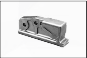
Jaw Extension for HIT5000 and HIT9000