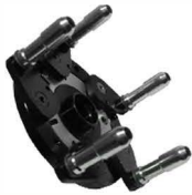
Pin Plate Adaptor Manual - 41FFA6478 Pneumatic - 41FFA5298