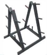
Accessory Rack 41FF03151