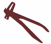
Weight Hammer 301400425