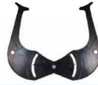
Rim Width Gauge 46FC77653