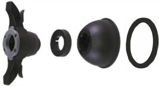
Manual Locking Kit 41FF83148