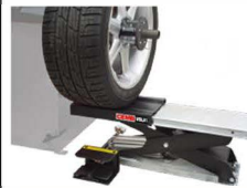
Pneumatic Wheel Lift 46FL85170