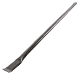
Bead Lifting Guide Lever DB12T