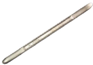
Bead Lifting Lever 511242