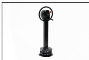
Wireless Remote #89238598