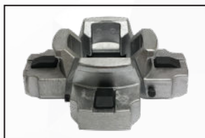
Clamping Protector for Alloy Wheels (Set of 4) #89234826