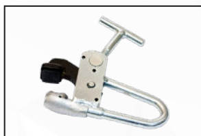
G-Clamp (Alloy Wheels) #89299271