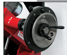
Post and cone detail >>