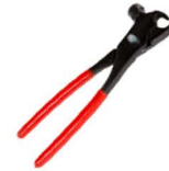
Weight Hammer 301400525