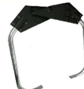
Rim Width Gauge 940051000