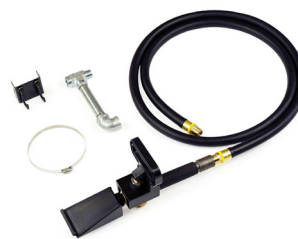
Auxiliary Bead Sealer (ABS) (PN 85606545)