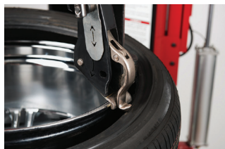
Leverless Upgrade (PN 85607471)