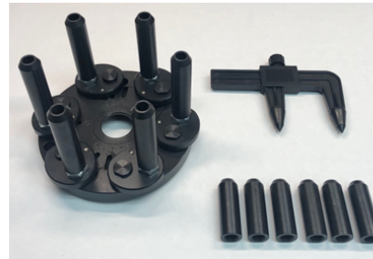
Reverse Mount Adapter (PN 85612559) Included with Purchase