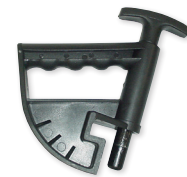
Manual Drop Center Tool (PN 8435685)