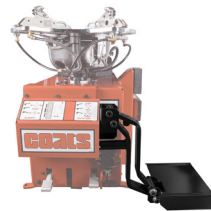
Point-of-Use Lift System (PN 85608609)