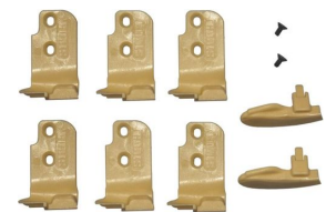
Leverless Duckhead® mount/ demount tool plastic inserts (89233409)