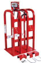
EL-X Express Lane® Inflation System (PN 85607770)