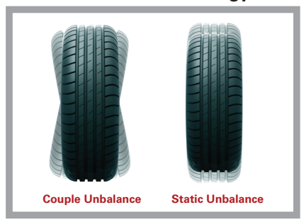
A unique balancing system (unbalance correction methodology) that minimizes both static and couple unbalance