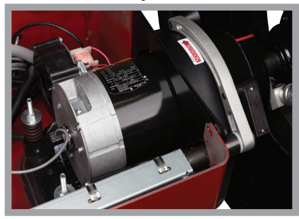
The motor and spindle are combined into a single, pre-balanced assembly that always stays calibrated to zero.