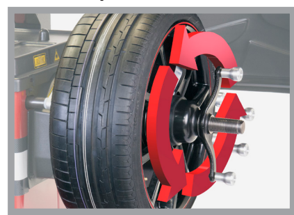
Provides the ability to thread the hub nut at the push of a pedal to improve the ease-of-use and speed of mounting the wheel

To learn more about the Coats 1600-3D Wheel Balancer, or any of our other quality products, contact your authorized Coats distributor or call 1-855-876-3864 for the dealer nearest you.