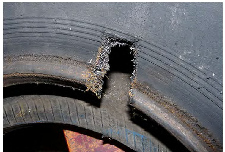
Detail of Notched Tire