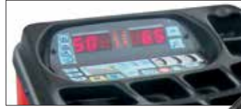
LARGE DIGITAL DISPLAY Integrated keyboard