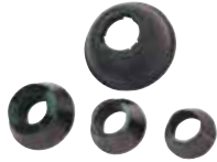
GAR 111 Passenger tire cone kit 1.75" - 4" (44-104 mm)