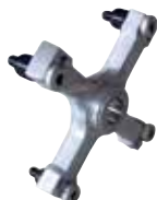
SHOWN: GAR 172 Four finger adapter

GAR 173 five finger adapter (5X225, 286, 335)