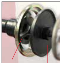
GAR 122 Truck spacer