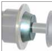
GAR 112 Light truck cone 3.75" - 5" (95-124 mm)