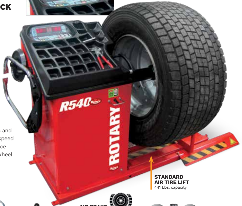
STANDARD AIR TIRE LIFT 441 Lbs. capacity

Specific balancing programs for static, dynamic and ALU wheels. One single spin with low rotation speed provides all the values. Readout of out of balance values and the related position on the wheel. Wheel diameter and width in inches or millimeters. Unbalance readout in grams or ounces.