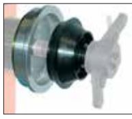
GAR 113 Light truck cone 4.65" - 6.8" (118-174 mm)