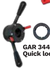
GAR 344 Quick lock