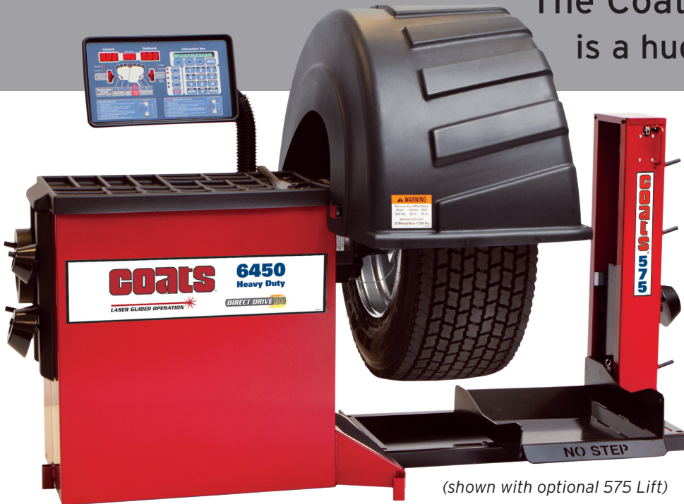
(shown with optional 575 Lift)

The Coats 6450 Series is a huge step forward.