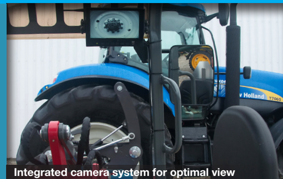
Integrated camera system for optimal view