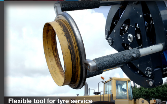
Flexible tool for tyre service