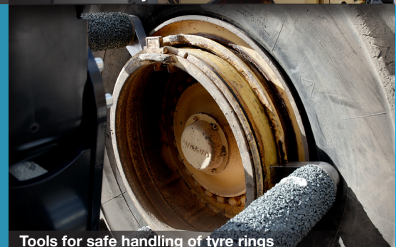
Tools for safe handling of tyre rings