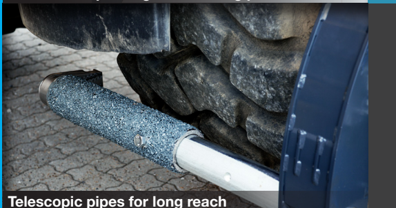
Telescopic pipes for long reach