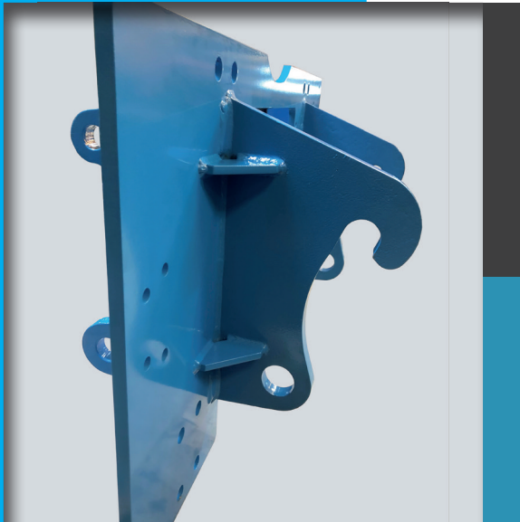
Customized pre-angled mounting plate