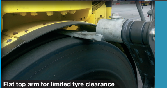
Flat top arm for limited tyre clearance